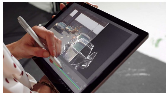
An engineer edits film special effects on a tablet.

Engineering light and sound effects well is really important to help tell the story of the film.