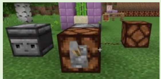
Observer and redstone in Minecraft.