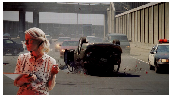
An engineer works on special effects on a film set.

Engineers are also involved in setting up special effects . For example, they might make sure a scene using them looks realistic and is filmed safely.