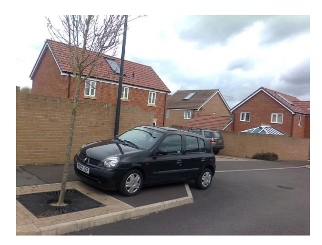
Figure 6 Pavement parking in Cheswick Village