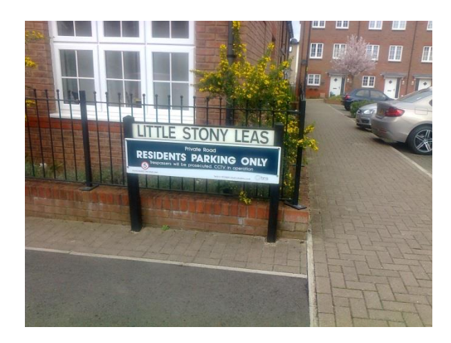
Figure 4, Platts Wood, Cheswick Village