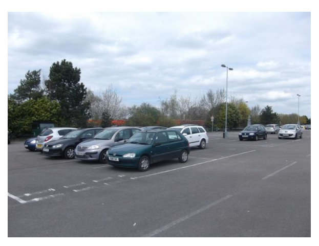
Reducing parking demand towards the store