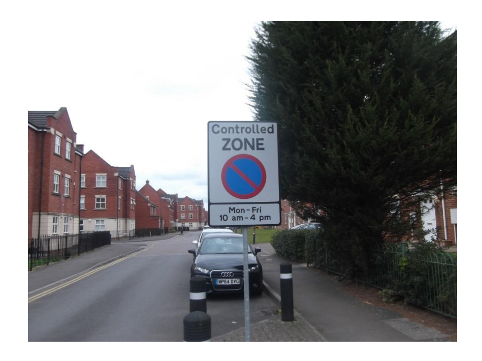
Figure 3: Parking restrictions in the Stoke Park housing estate

The housing area has retained several unrestricted on-street sections for parking and a small number of designated parking bays for visitors to the Stoke Park estate. Following observations taken during the survey, it was estimated that there is capacity for up to 150 legally parked vehicles during the day.