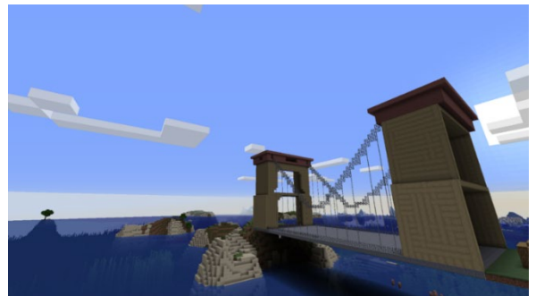
Suspension Bridge built by Alex Kiyani, Science Hunters participant 2019

Remember - You will likely find multiple solutions! As an engineer it is up to you to use your engineering judgement to decide which is the best route. Good luck!