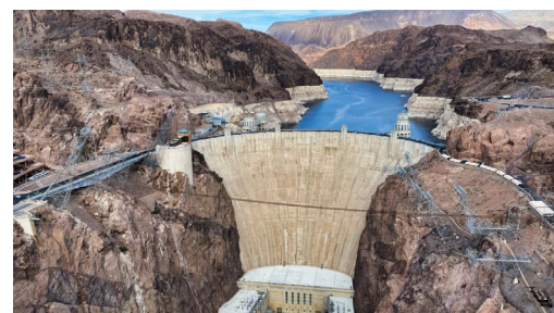
The Hoover Dam