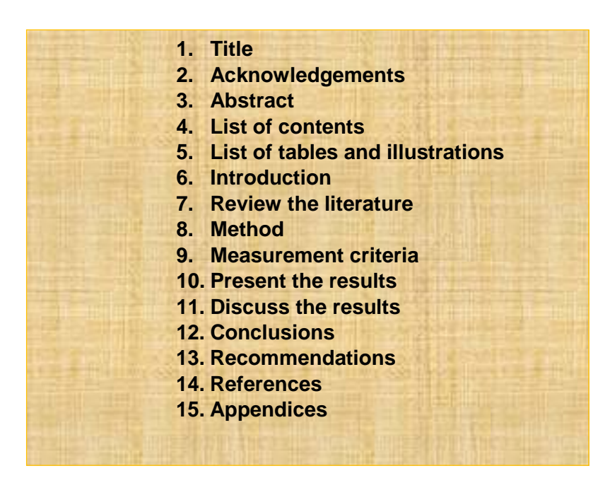
Figure 2 : Suggested project/dissertation structure (Adapted from Skills4Study, 2015)

If not available, you can follow the suggested structure shown in figure 2: