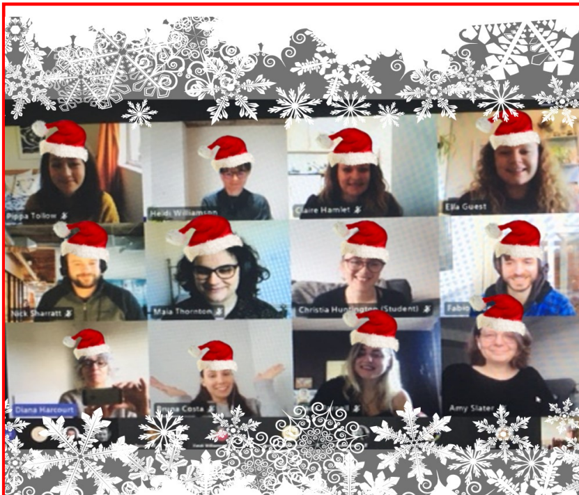
Our 8th Virtual VTCT Foundation research team meeting of 2020!

Lastly, we would like to wish you all a Merry Christmas and a Happy New Year .