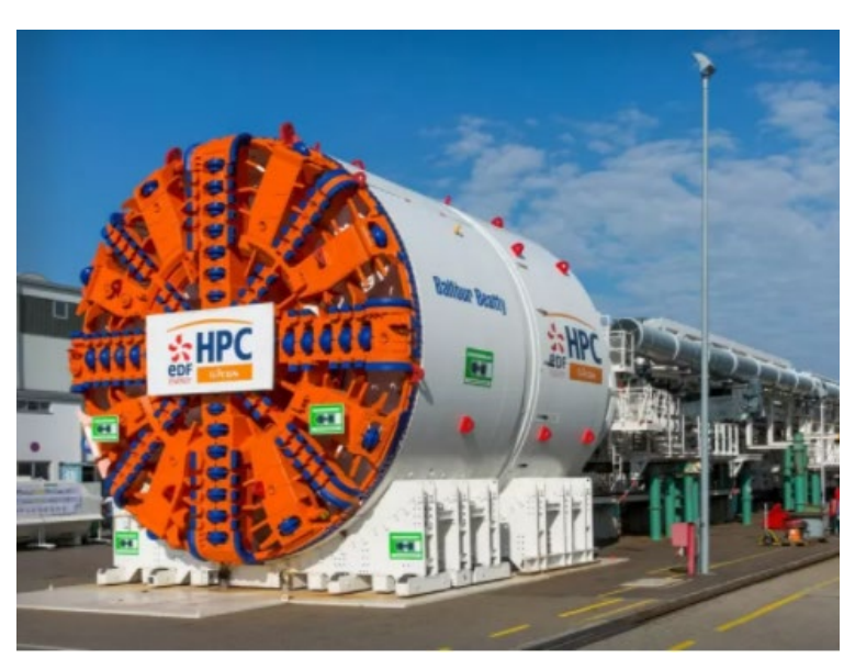
A tunnel boring machine being used at Hinckley Point C.

Animals can also use tunnels as safe ways to get around. This website shows images of animals doing this around the world.