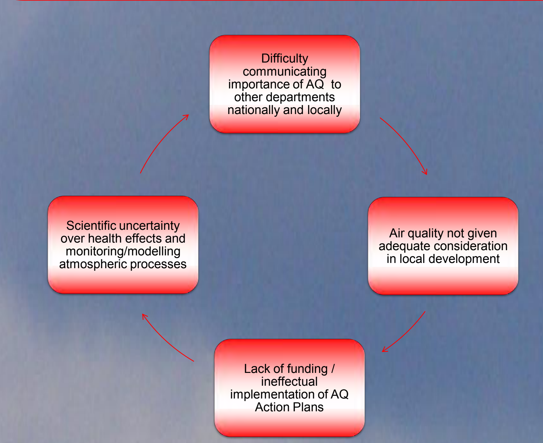
Figure 2: Cycle of the failure of UK air quality management

There are difficulties in communicating the importance of air quality issues due to the inherent scientific uncertainty in assessment and health impacts (Figure 2).