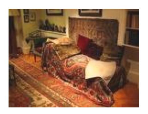
A POSTGRADUATE CONFERENCE CENTRE FOR PSYCHOANALYSIS MIDDLESEX UNIVERSITY LONDON