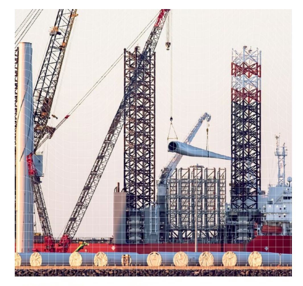
A Net Zero workforce May 2023