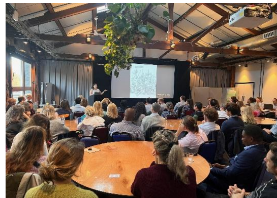
Above: NIHR Emergency Care Incubator Symposium.

As part of the PARADE project ( PAR amedic Active lives promotion for olDEr people), three highly successful workshops were held during October to shape the next phase of research on falls prevention and healthy ageing. Across the sessions, 40 participants took part, including 10 patient and public representatives, care home managers and staff, paramedics, and representatives from Age UK and Sirona. The workshops shaped priorities for intervention design, ensured the research reflects lived experience and workforce realities and are already influencing the development of falls prevention practice and patient-facing resources.