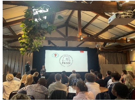
Above: REACH Annual Showcase.

The NIHR Emergency Care Incubator Symposium was held on the 10 and 11 November 2025 at The Watershed in Bristol. The programme was delegate led and faculty facilitated. It included seven interactive workshops aimed at stimulating and refining research ideas, developing a range of research skills (some seldom taught), and fostering emergency care research in a supportive and non-intimidating environment. There were 68 people in attendance.