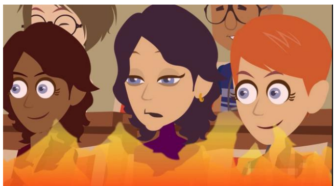
Coping with anxiety about lectures

There's also a range of online resources to help: