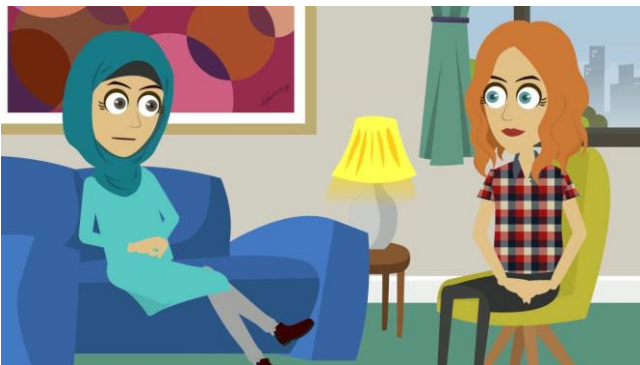
Coping with anxiety about exams

Did you know you're not the only one that is anxious and stressed right now? Our Wellbeing Service have produced some videos that draw directly off your own personal struggles and experience. Have a watch, they're only short.