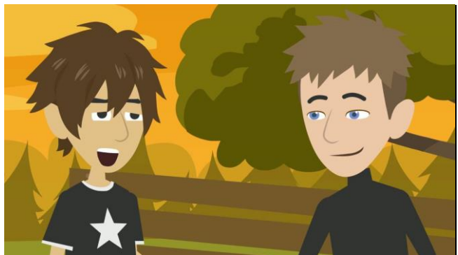
Coping with anxiety about making friends