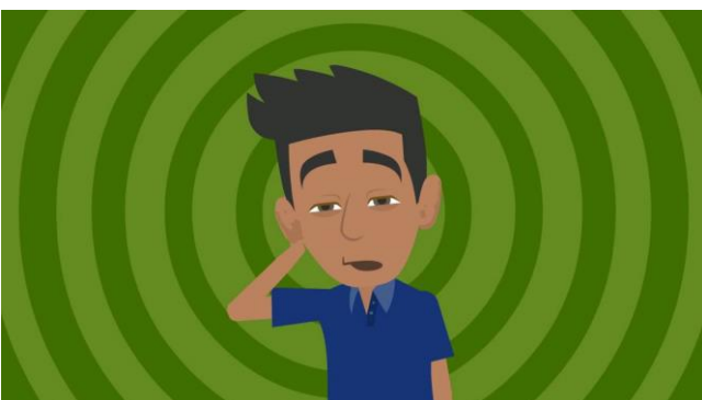
Coping with anxiety about crowds