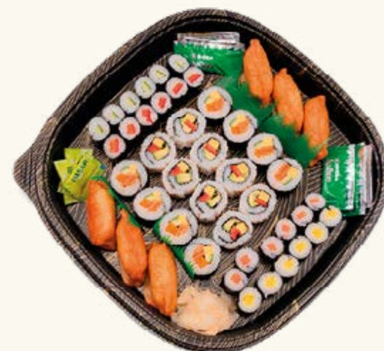
Vegetarian Osaka Tray