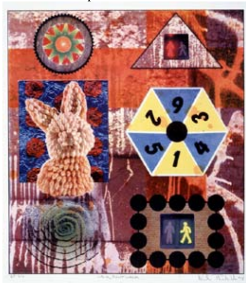
Fig 3. A six colour digital collotype by Paul Thirkell

This approach has enabled the possibility of printing an image in much the same manner as a traditional collotype facsimile. For the fine artist however, it also allows the onscreen images interpretation in hardcopy, to print beyond CMYK gamut thus enabling the artist to break free of what could be termed as the current homogenised approach to colour reproduction.