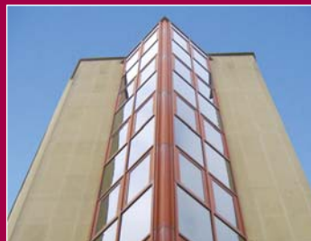
NEWMINSTER HOUSE BALDWIN STREET BRISTOL BS1 1LT