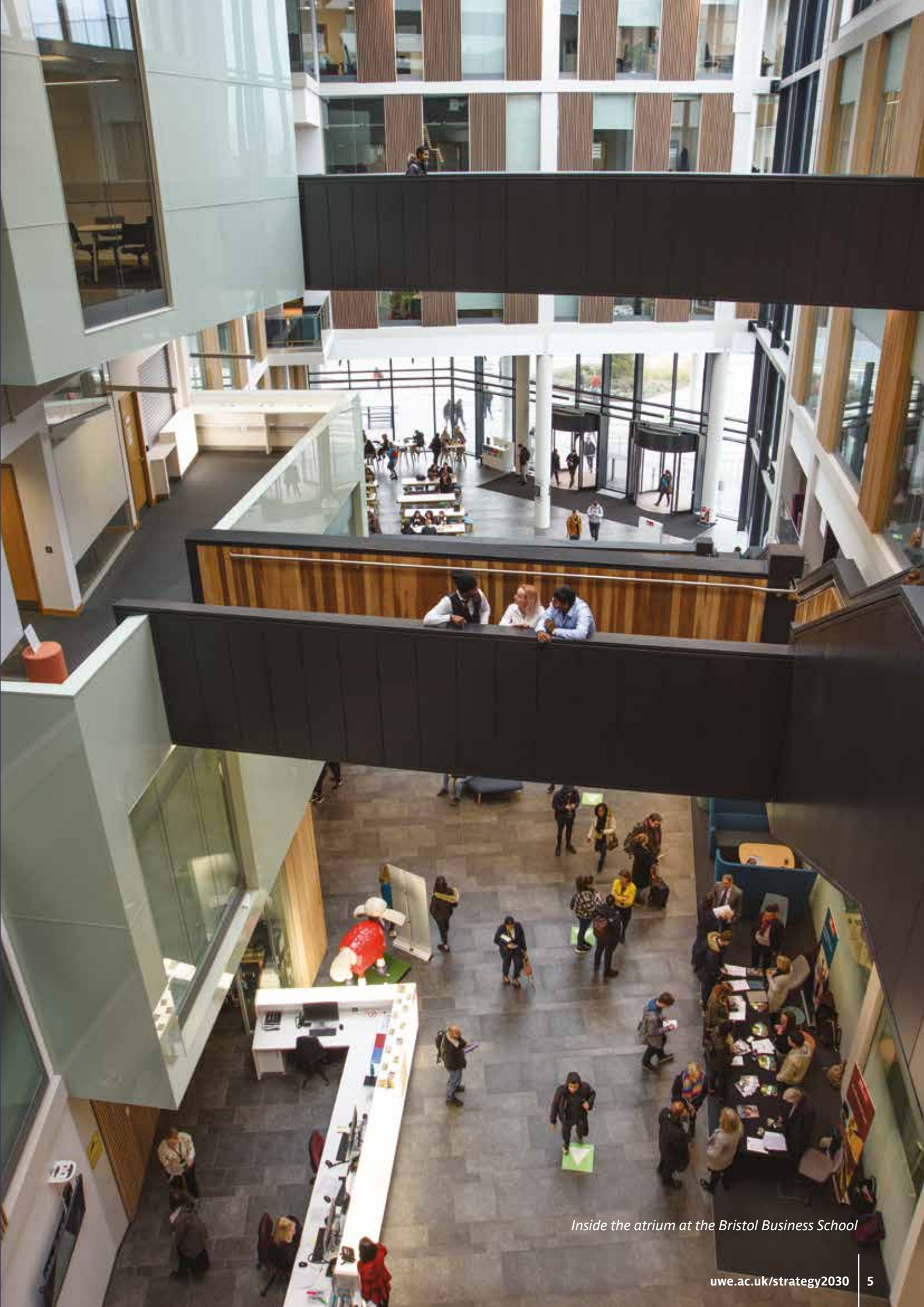
Inside the atrium at the Bristol Business School