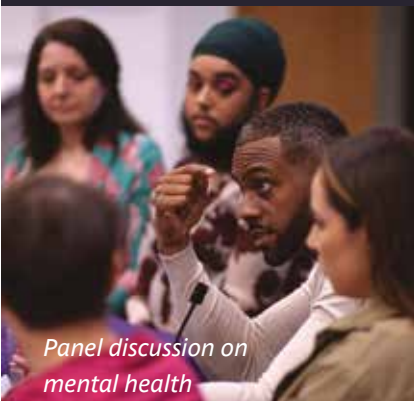
Panel discussion on mental health

Activities to date include a new podcast series entitled Let's Talk Now , where staff and students discuss their experiences of mental health issues; the creation of the Mental Wealth Lab Fund, where staff and students can bid for funding for projects that explore new ways of promoting positive mental health; events; panel discussions; guest talks; academic research and activities created in partnership with the Students' Union.