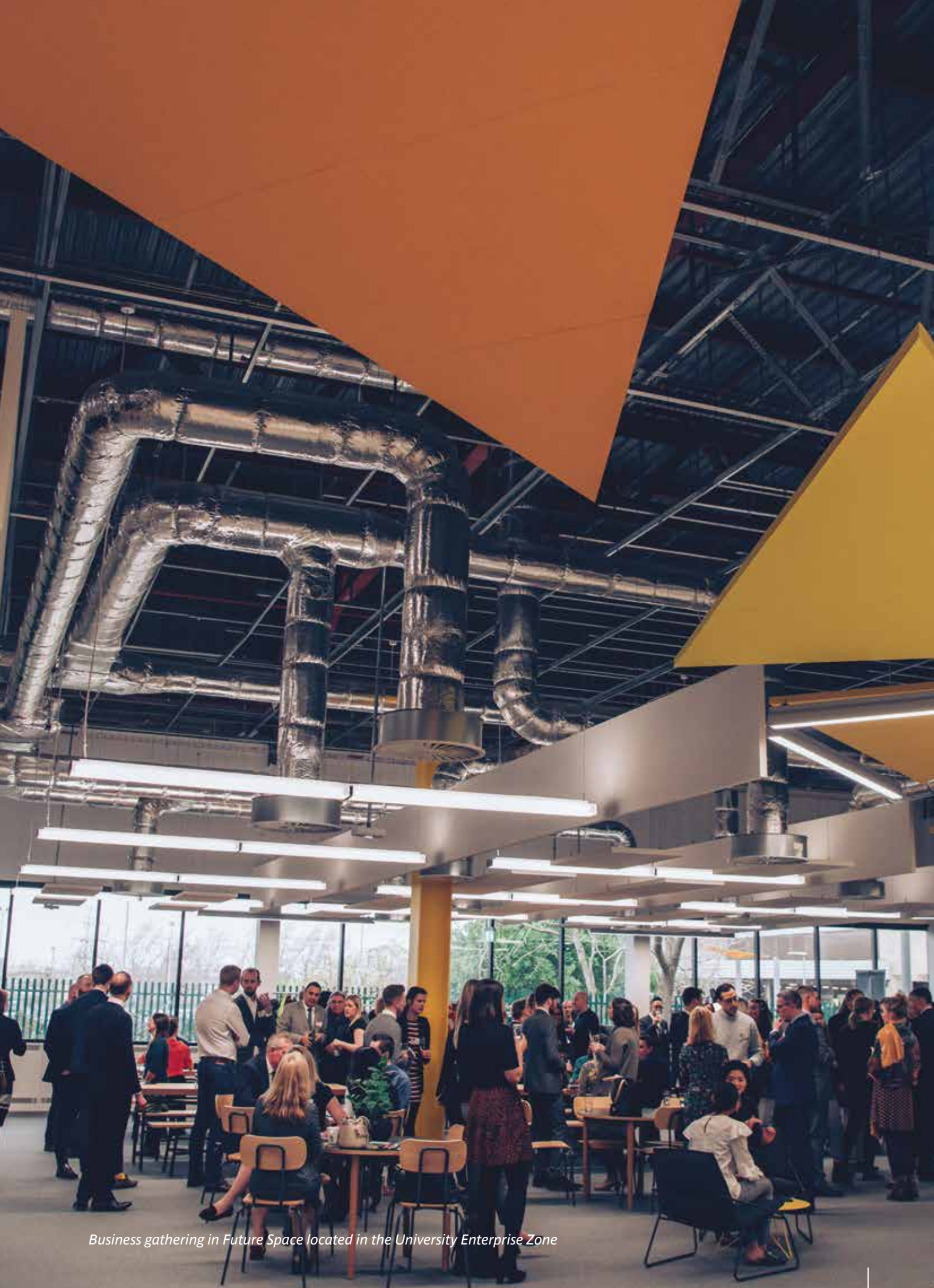
Business gathering in Future Space located in the University Enterprise Zone