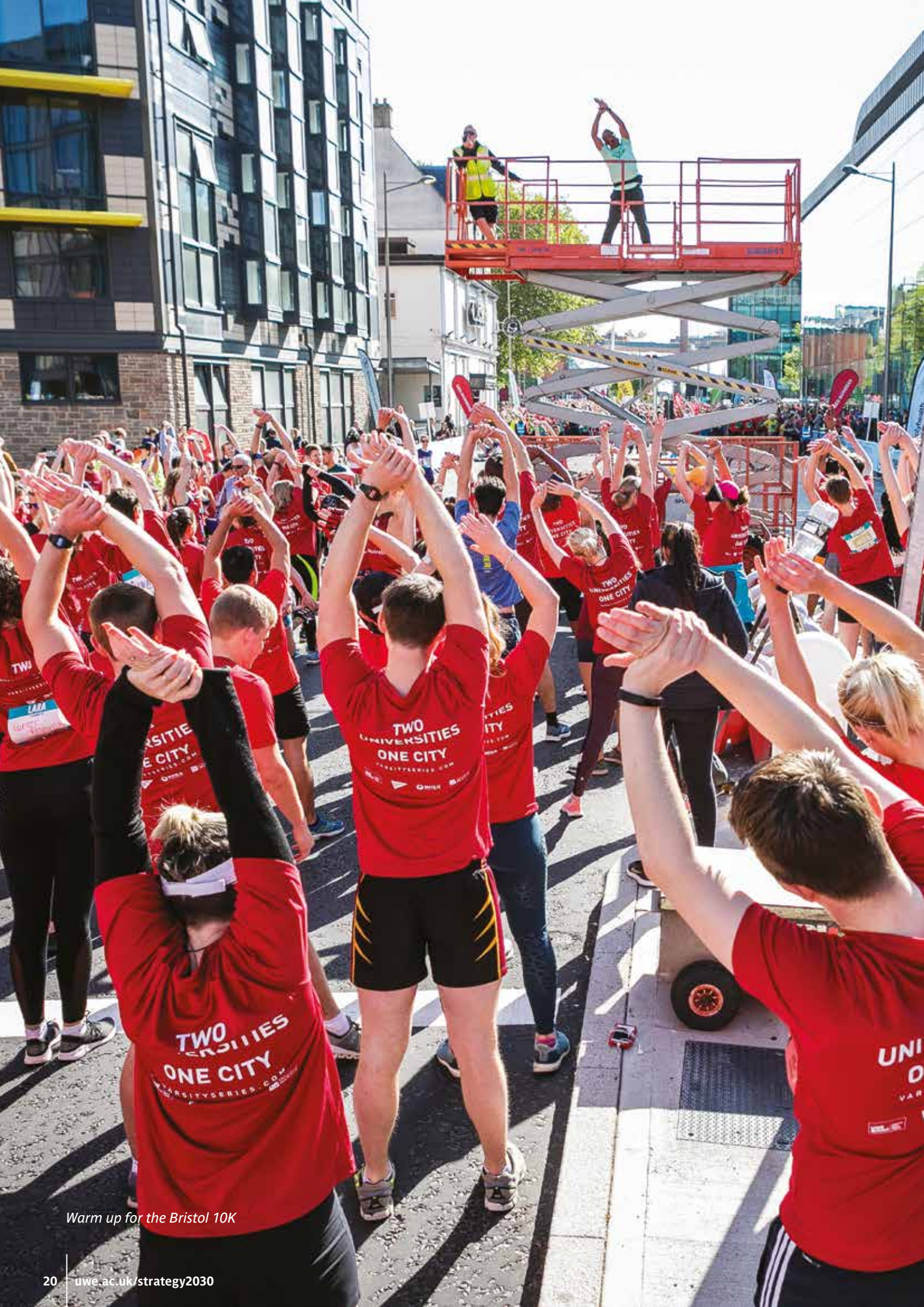
Warm up for the Bristol 10K