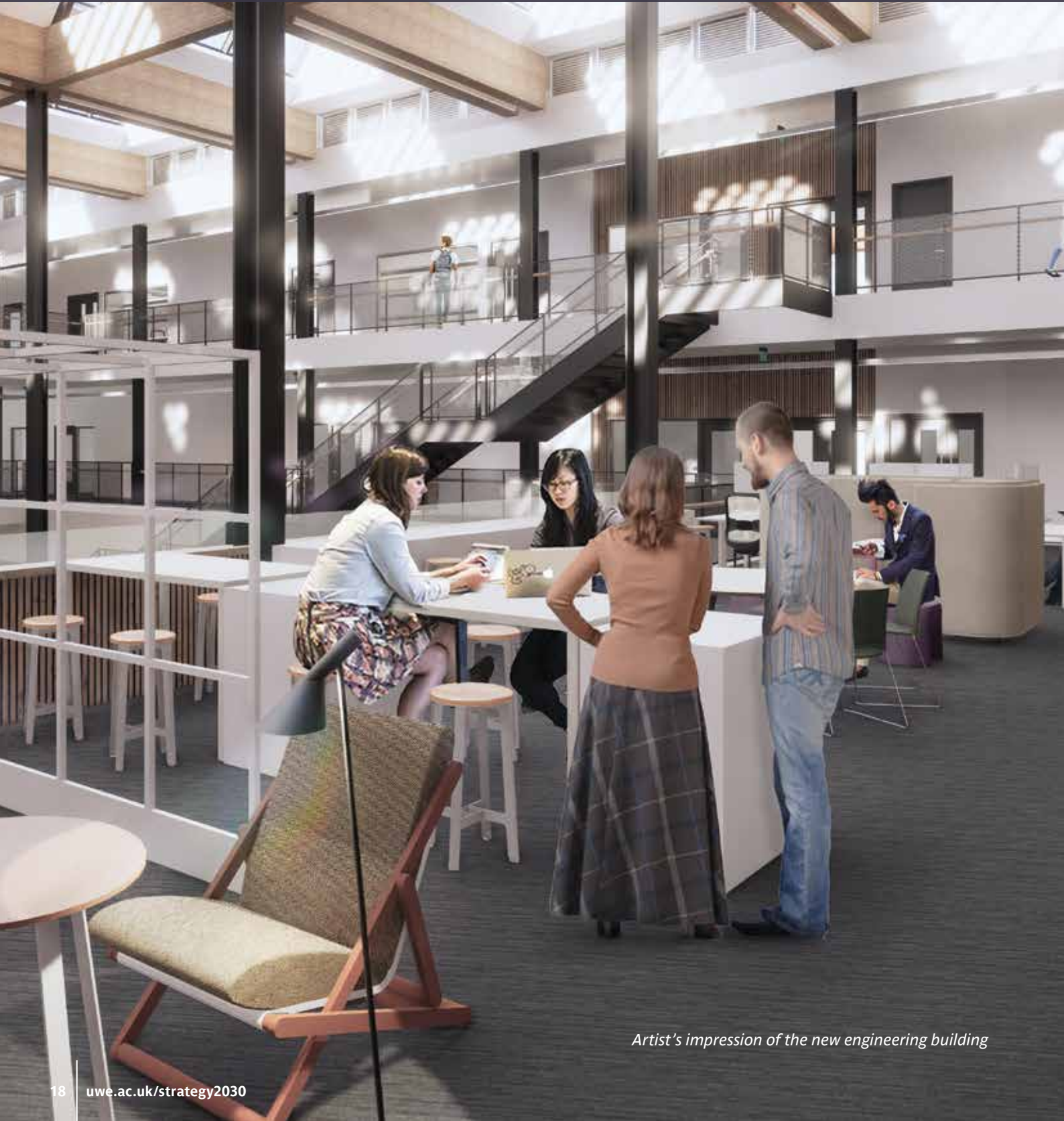
Artist's impression of the new engineering building