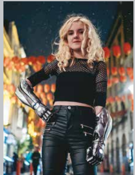
Open Bionics makes prosthetic limbs accessible, usable and fun for child amputees

Our research approach will be collaborative, agile and student-facing, with local focus and global reach.