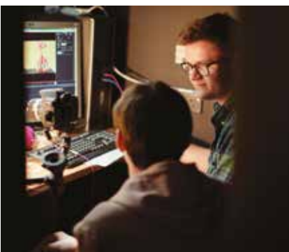
In the Animation department

This strategy sets out our focus for the next 10 years. It will evolve and develop as we continually review our own performance and adapt to a rapidly changing external environment.